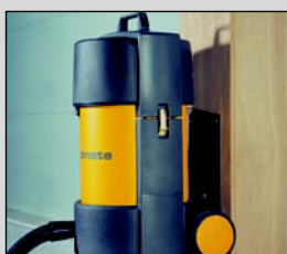
Wall mounting bracket MBH.