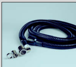
Nozzle kits to provide extraction facility on standard welding torches; type NKT for top-extraction and type NKC for annular extraction.