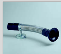
Funnel extraction nozzle EN-20.