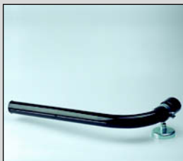
Extraction nozzle EN-40 for max. 40 cm electrodes.