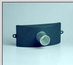
Hose connection HCH 45 to dispose filtrated welding fumes, e.g. when welding stainless steel.