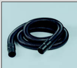
Hose length 2.5 m H 2,5/45. Hose length 5 m H 5,0/45.