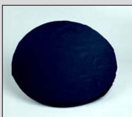
Activated carbon filter FAC HV to neutralise smells.